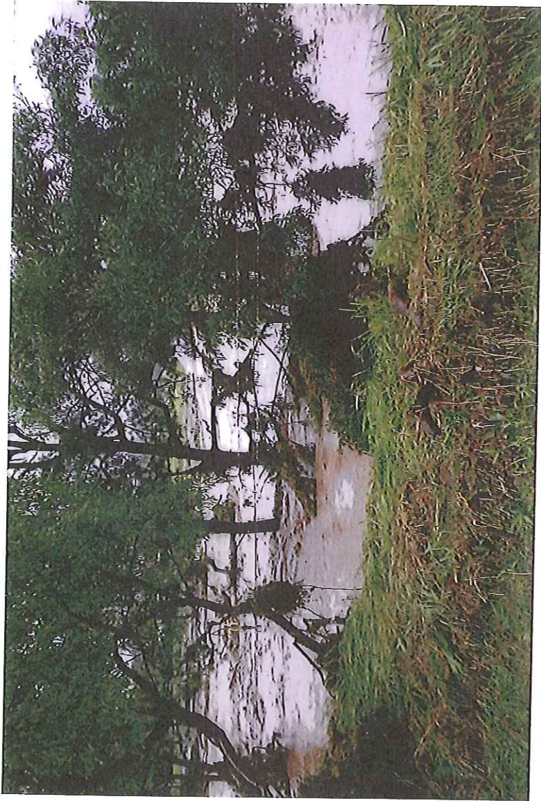
1. Rocky Creek.