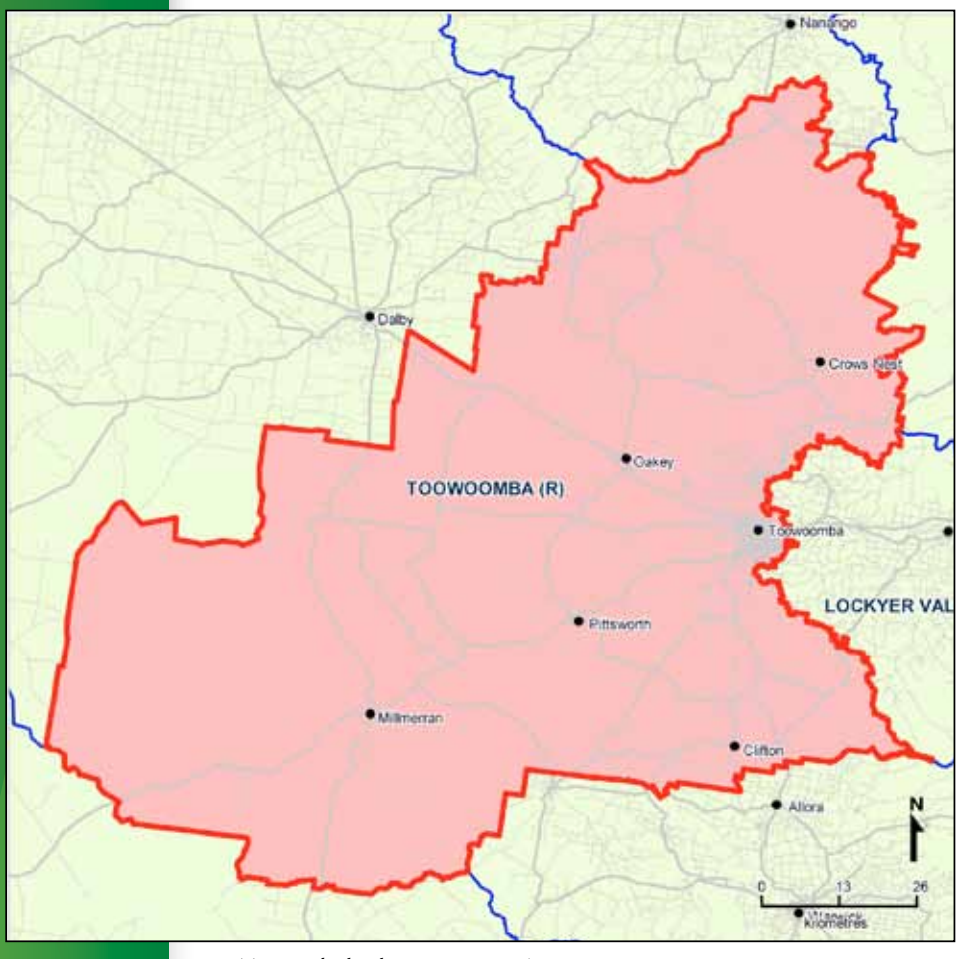
Toowoomba local government area!