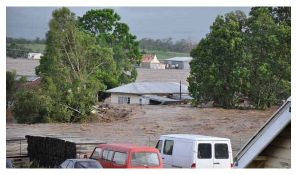
Flash flooding in Grantham, 10 January 2011

There is a 2.10 pm note in the running log of advice from the district disaster management group of a house flooded at Spring Bluff; that 'people may be stuck', and that rescuers (presumably Queensland Fire and Rescue Service swift water rescue) were 'unable to get to it'. At 2.45 pm, the district disaster coordinator contacted the local disaster group to advise of cars being swept away in Toowoomba and asked whether anyone was missing from Murphys Creek.<sup>92</sup> There was further confirmation from an unknown source, relayed to the local disaster group at 3.30 pm, of two houses at Postman's Ridge having been swept away.<sup>93</sup> It does not appear, though, that any detailed information about the state of Lockyer Creek was conveyed to the local disaster group or the council. In particular, there is no record of their being alerted by anyone who saw the rapid rise in the creek at Helidon.