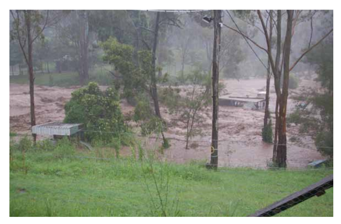
Floodwaters at Spring Bluff, near Murphys Creek, 10 January 2011

The Department of Environment and Resource Management (DERM) owns the Spring Bluff stream flow gauge and records its data, but the gauge is not telemetric (it does not report automatically). Consequently, the data was not available to either DERM or the Bureau of Meteorology while the flood was actually happening.<sup>71</sup>