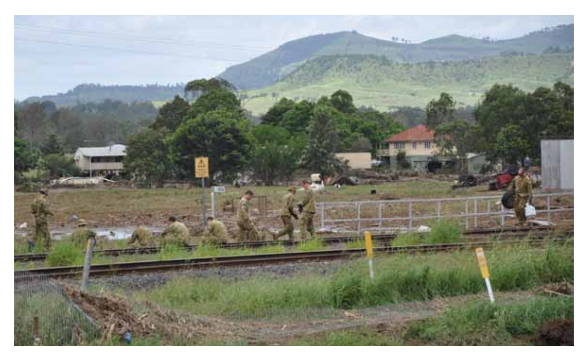
Members of the Australian Defence Force at Grantham assisting in the aftermath of the floods, 13 January 2011

One of the most important aspects of the response in the Lockyer Valley was the search for people missing after the floods swept through. Hundreds of Queensland police officers, with assistance from the Australian Defence Force, the Federal Police and the SES, were involved in the search. On 13 January 2011 approximately 120 defence personnel came to Grantham to help; because of the size of the task, a further three platoons were requested and arrived in Grantham on 15 January 2011. At The search area included over 663 square kilometres and 131 kilometres of creek line. It covered Spring Bluff to Grantham; the greater town area of Grantham; and the area east of Grantham to the Brisbane River. Defence force members walked the entire 131 kilometres of creek line on three occasions. The defence force provided search helicopters and machinery for use in the search. One area of debris which had to be searched was described as being at least 2000 square metres in area and several metres deep. In addition to foot searches, air and boat searches of sections of the Brisbane River and Moreton Bay were carried out; but all those found were located by searchers on foot.