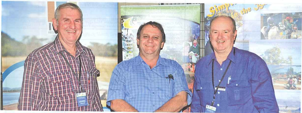
The Mayors from Isaac, Central Highlands and Banana Councils were all smiles at the Partnering Now for the Future Forum.